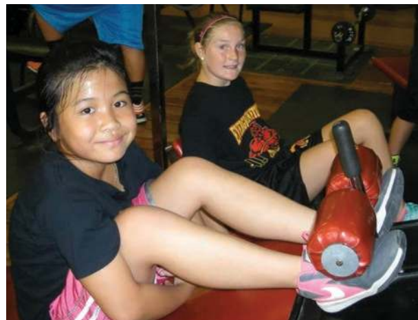
Building the MPTF endowment means we can support more innovative public school projects like the Evergreen Fitness Team in Kalispell, fighting obesity and teaching healthy habits to students and their families.

Not one penny of the endowment itself may be spent.