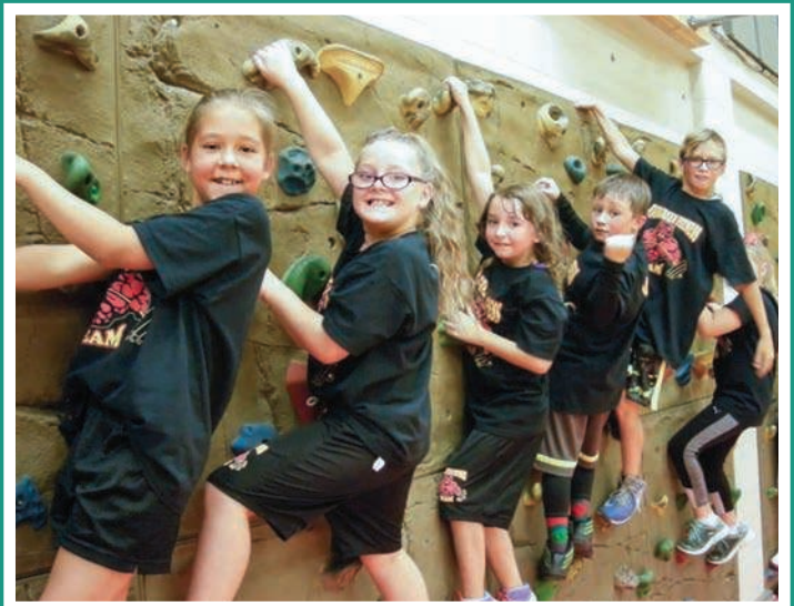
Climbing the walls at Evergreen School in Kalispell: a fitness and health program for kids and their parents, funded in part by a Karen Cox Memorial Grant. More about the grants on page 3.