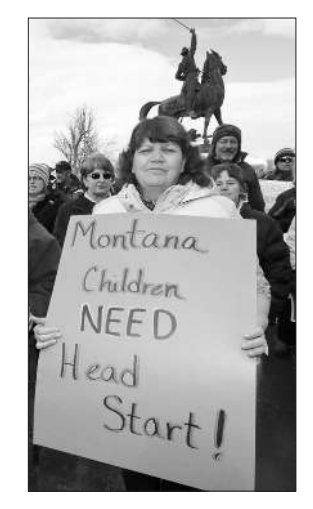
Head Start supporter at our Feb. 21 rally at the capitol.

SB 54 (Bayleat) – see above SB 129 (Lewis) – see above SB 315 (Ripley) – see above SB 328 (Lewis) – see above