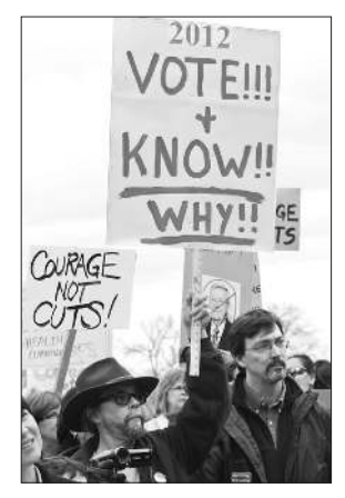
Sound advice from April 1 rally participants: Let's never have another legislature like this one.

Votes: Motion to blast off the table House – failed 39-54, 2nd reading House – failed 42-58 Status: Died in the House