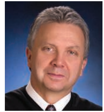
DIRK SANDEFUR Supreme Court