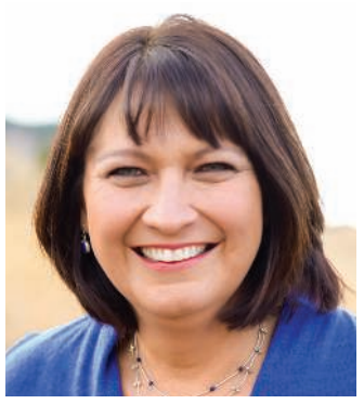
DENISE JUNEAU U.S. Congress