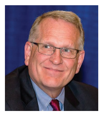
TIM FOX Attorney General

These candidates all strongly support public education, public services, educators, and public employees.