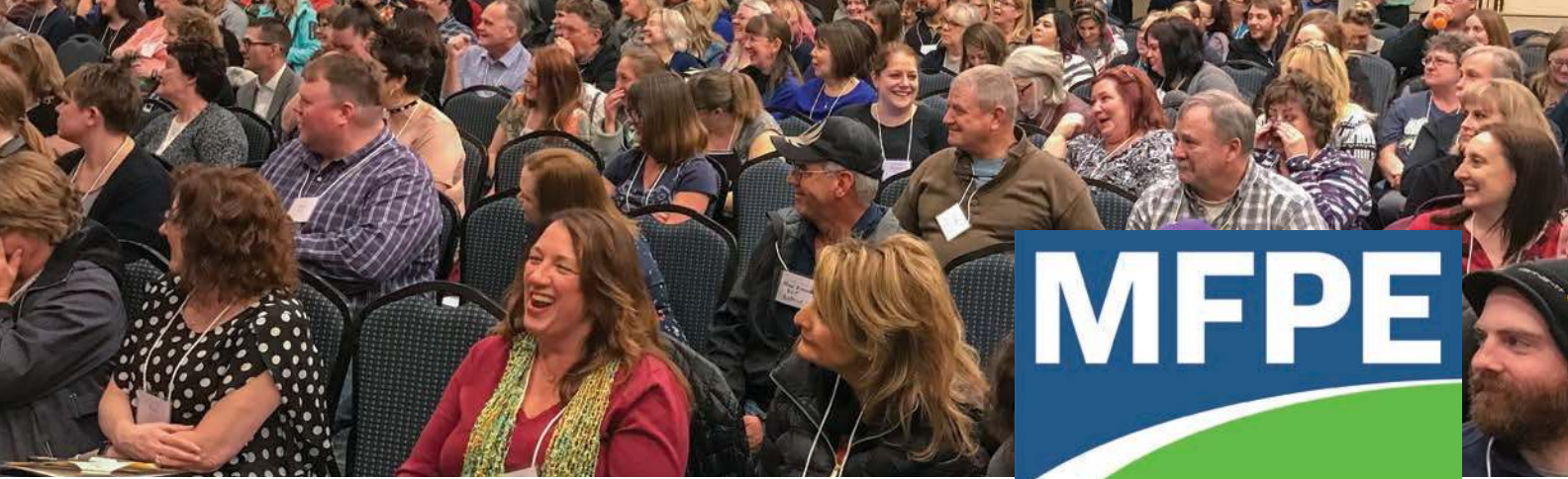
Delegates at our first MFPE Annual Conference share a light-hearted moment.