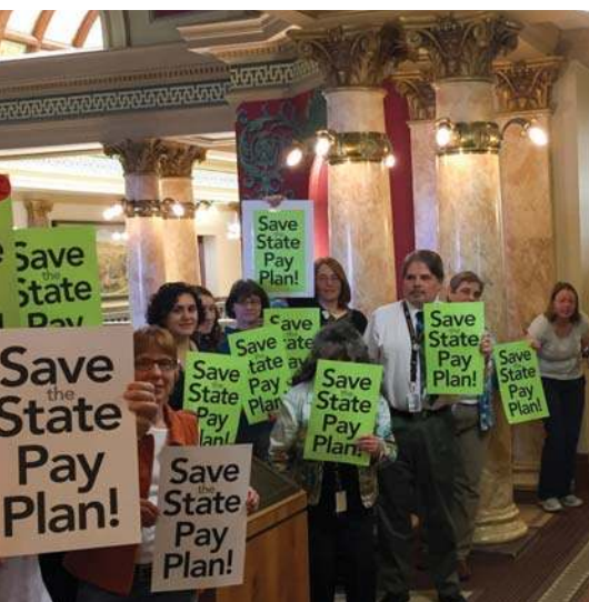
State employees never gave up. It paid off.