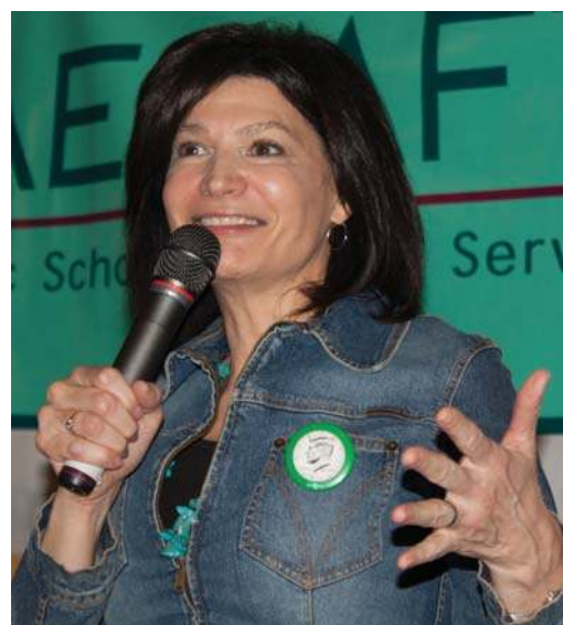
NEA President Lily Eskelsen García says, "The only struggle you lose is the one you abandon."

National Education Association (NEA) President Lily Eskelsen García: "We're in the business of giving children, families, and communities the hope that they can have a better life. And that has made us public enemy #1 to a small group of people who want to privatize everything public: schools, prisons, pensions, programs. We're engaged in a mighty struggle. But the only struggle you lose is the one you abandon. Unity is our weapon."