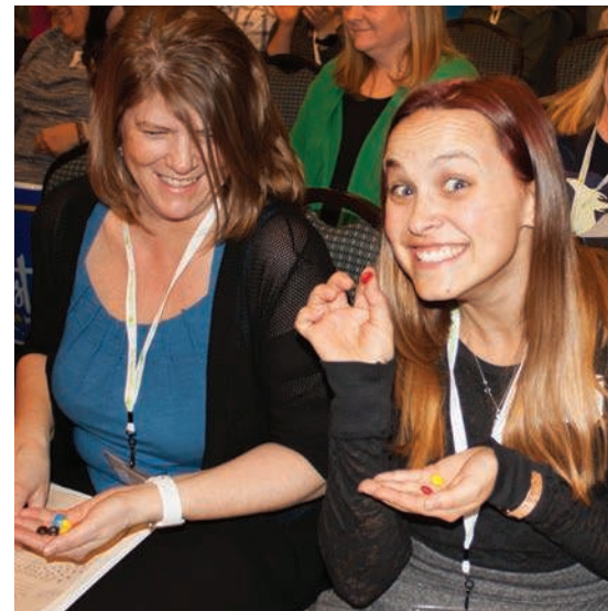
MEA-MFT representative assembly delegates savor "membership seeds" (aka M&Ms). More about RA inside.