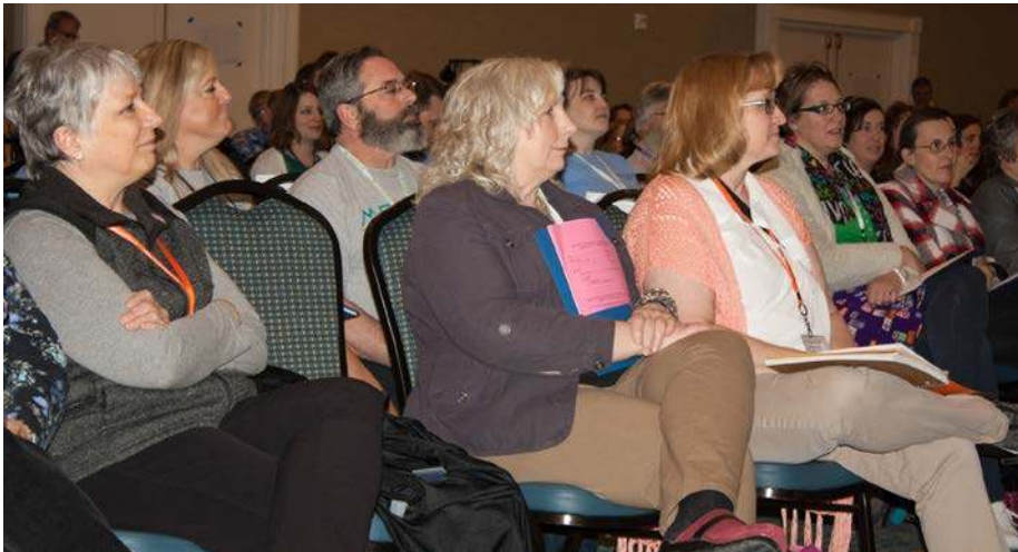
Participating in history: RA delegates listen to merger discussion.