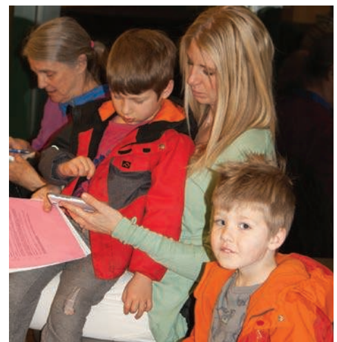
Union is family! RA begins with "Little RAs" held across Montana. These folks attended the Bozeman Little RA.