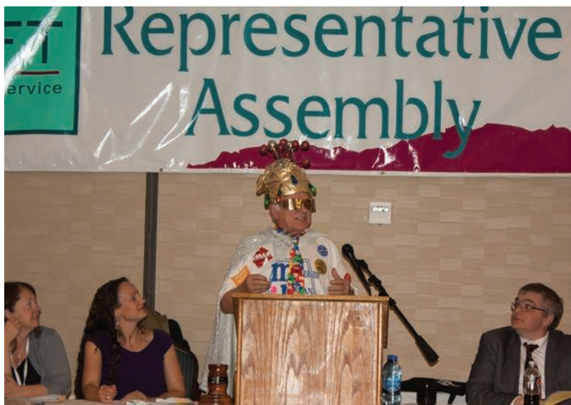
Membership Man gives his annual overview of just about everything.