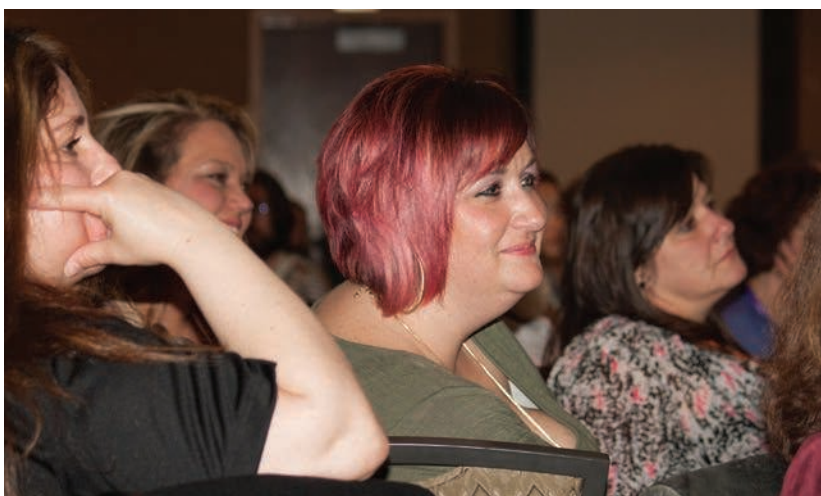
Delegates celebrate MEA-MFT members of the year (see p. 3).