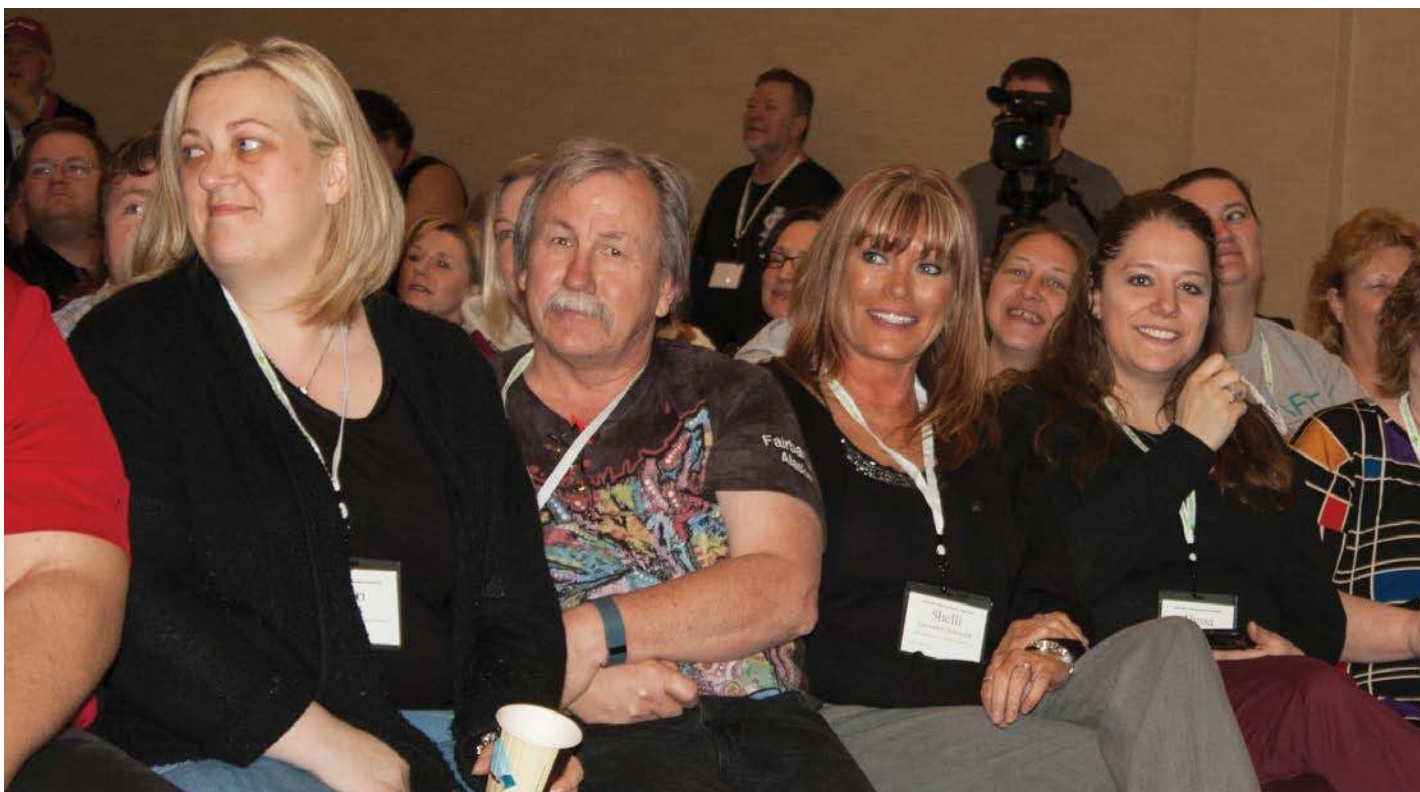
Delegates listen to Gov. Steve Bullock during representative assembly 2017.