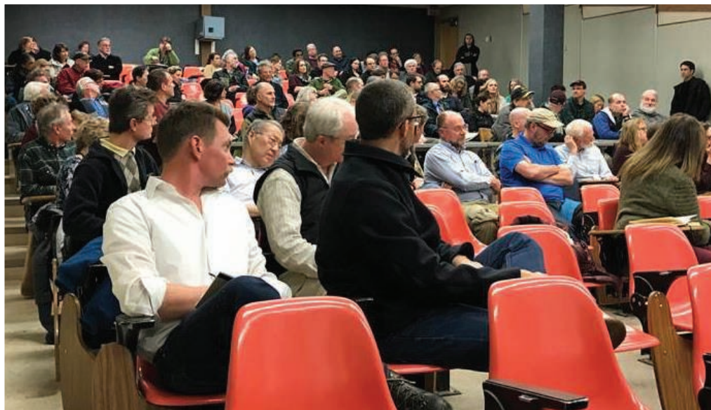
MEA-MFT members in the University Faculty Association discuss the local union's role in UM's prioritization process.

"We have a huge charge to come up with a set of principles and values to guide UM into the future, stabilize it financially, and regain the student enrollment we lost," he said.