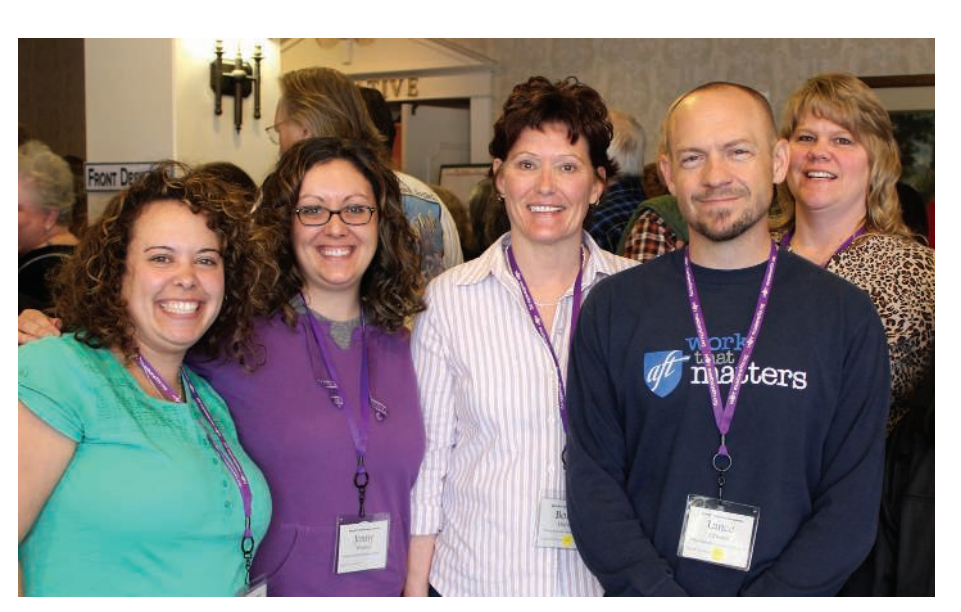
Above & below: Scenes from recent MEA-MFT Rep. Assemblies. Join us for the 2015 Rep. Assembly, March 27-28 in Helena.

So, GET REGISTERED! See you in Helena for Rep. Assembly! ✓