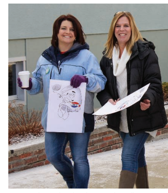
State employees head to the capitol to talk about the state pan plan.

• HB 249 (Noonan): Medicaid expansion to provide health care for 70,000 uninsured Montanans, almost entirely with federal funds.