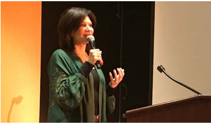
NEA President Lily Eskelsen Garcia

and thousands of public school teachers like them across the state, who do important work every day to give our kids a brighter future.”