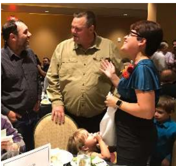
U.S. Senator Jon Tester catches-up with MFPE Members and poses with Teacher of the Year recipients and alumni.